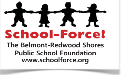
2013-2014 School-Force Revenues

Reading Power, School-Force's annual Read-a-Thon, is a fun two-week event that benefits our students by encouraging the love of reading while raising money for our children's education. Money raised during the Read-a-Thon supports a literacy-rich environment in our schools as one part of a comprehensive education.